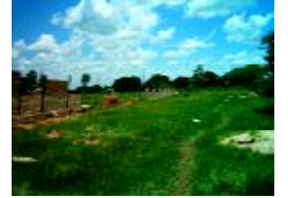
The first few days of construc-