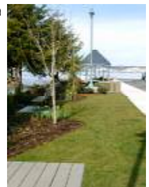
Bricks line the gazebo inside & out it with names of supporters.

P.S. For those out of staters we will mail your hot dogs to you and someone from the board will call you and sing to you over the phone.