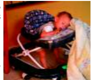
the Comedor's baby