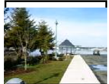
Great entrance for a bride

It all began when the South Kitsap Rotary began looking for a project to honor their Rotary International's Centennial Celebration. (By the way Happy Birthday Rotary!) The idea came up to transform this ugly strip of property into a park. S.K. Rotary took on this challenge. This is a small club, (I call it the Burrito Club, they eat Mexican every Tues.), so they had to work mighty hard to accomplish this feat in the time they wanted.