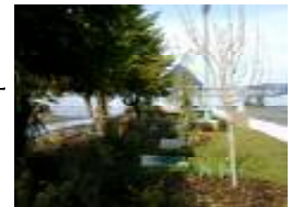
A beautiful array of plants

The Rotary Club put many work parties together from August 2004 and finished only on Tuesday February 22nd, the day they turned it over to the city. Etta's friends were always invited to help at these wacky work parties. We had fun digging, planting, hauling, ripping out, laughing with everyone whether they were Etta's teenage friends, work release folks or Rotary. There were always lots of laughs and sometimes some really good food. Now there is nothing to do but sit back and enjoy. This park will witness many special moments of first kisses, pleasurable walks, quiet lunches and maybe even a wedding or two. It is a good place on this earth.